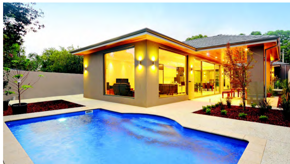
Expansive windows and walls of glass provide an outlook over the pool and alfresco area.

• 900mm Hotplate • 900mm Oven • 900mm Rangehood